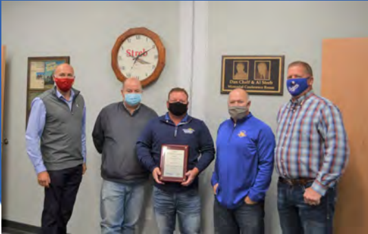
Streb Construction Co., Inc.