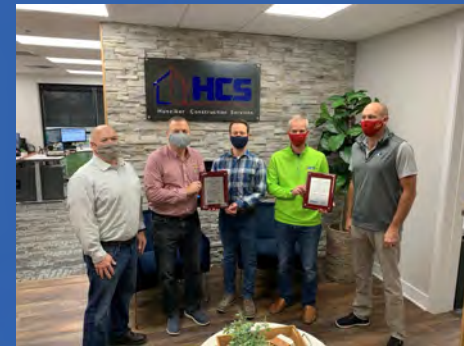
Hunziker Development and Hunziker Construction Services