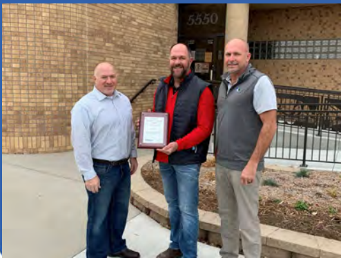
Concrete Supply, Inc.