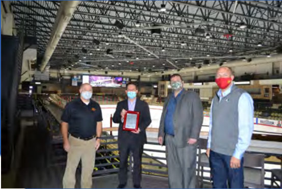
City of Mason City

Infrastructure – Structures & Sustainable Practices