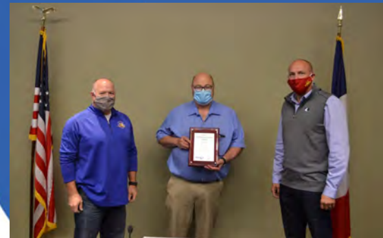
City of West Burlington