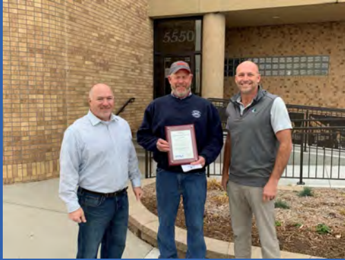
Hetzler & Rhodes Concrete Construction