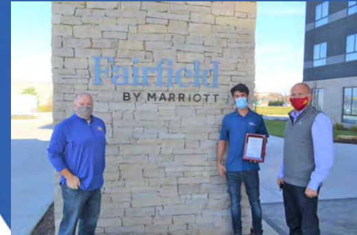
Heart of America Group