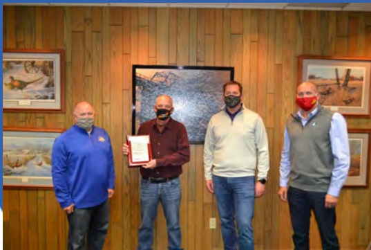
Ideal Ready Mix Co., Inc.