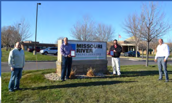
Missouri River Energy Services