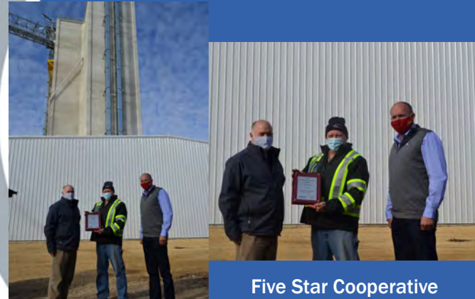
Five Star Cooperative