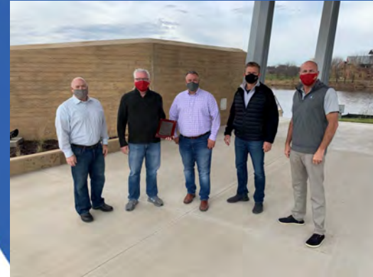
City of West Des Moines