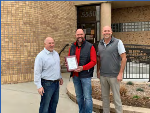
Concrete Supply, Inc.