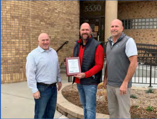
Concrete Supply, Inc.