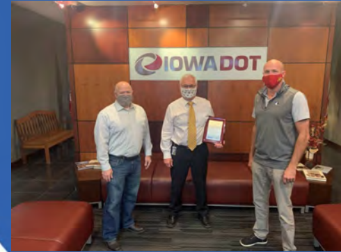
Iowa Department of Transportation