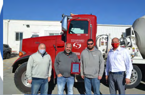
Standard Ready Mix Concrete, Co.