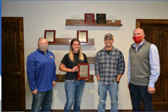
Jones Contracting Corp.