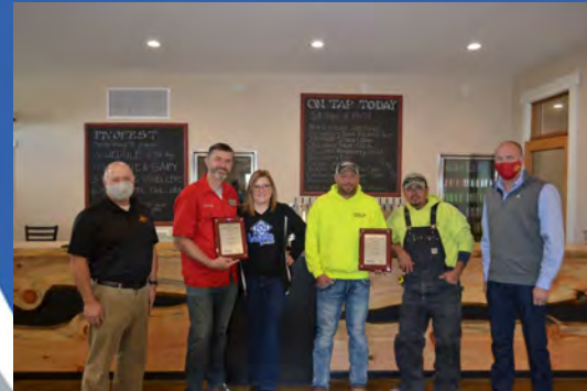
Northeast Iowa Sprayfoam & Const., LLC