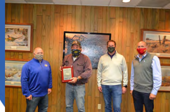
Ideal Ready Mix Co., Inc.