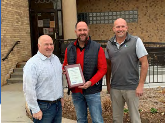
Concrete Supply, Inc