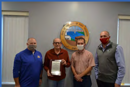
City of Fort Madison