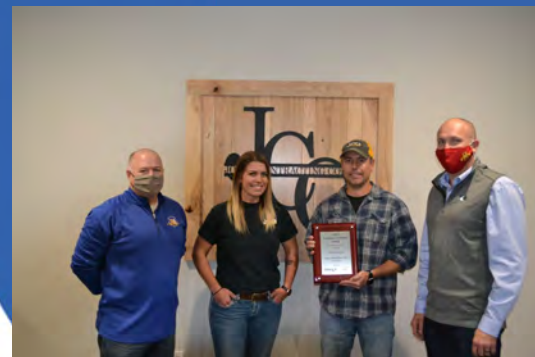
Jones Contracting Corp.