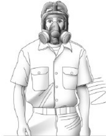
Full Facepiece Elastomeric Respirator APF=50 Needs to be fit tested

Original illustrations created by Attilis & Associates