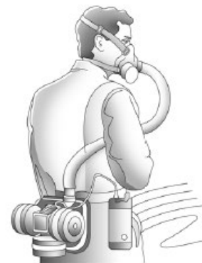
Tight-Fitting Half Facepiece Powered Air-Purifying Respirator (PAPR) APF=50 Needs to be fit tested