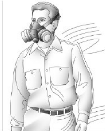
Half mask Elastomeric Respirator APF=10 Needs to be fit tested