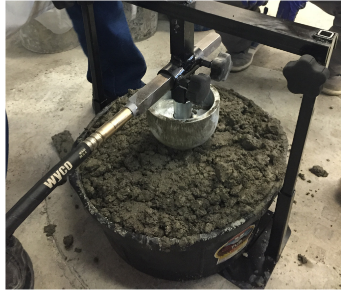
Performance Engineered Mixtures can be assessed using a variety of methods, including V-Kelly Test