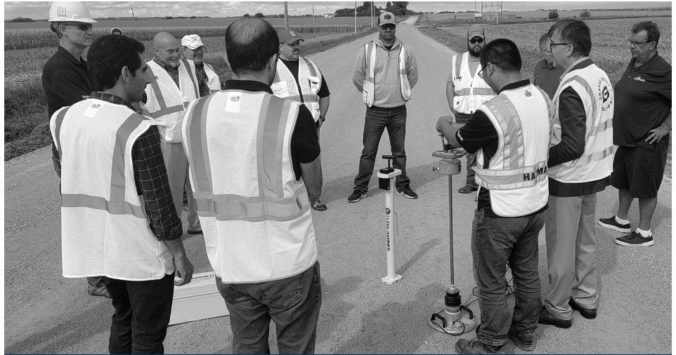
Demonstration of base stabilization testing equipment at the test site near Independence, Iowa

From there, the idea was submitted to the Iowa Highway Research Board, which is now sponsoring the PROSPER project along with the Iowa Department of Transportation (DOT).