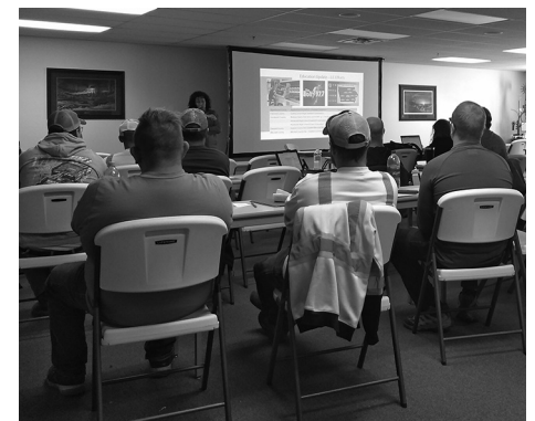
The 2023 Iowa Streets and Roads Workshop and Conference (top) and Multidisciplinary Roadway Safety Series (bottom) events kept Iowa LTAP busy this fall