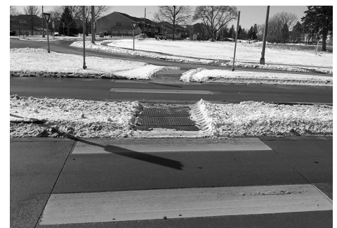
Pedestrian walkway across a median refuge island (left) and roundabout splitter island (right)