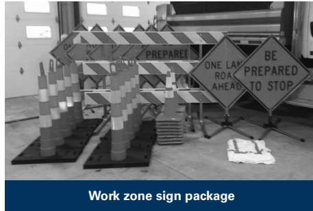
Work zone sign package

"This year, the program provided basic work zone signs, equipment, and personal protection vests to 12 smaller cities that