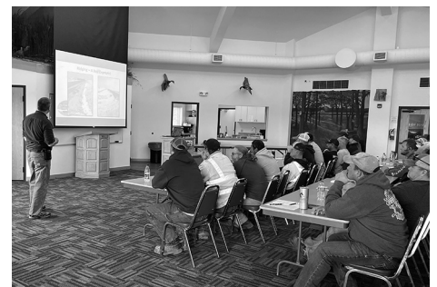
2023 Iowa Winter Maintenance Workshops held in Hampton, Atlantic, and Ainsworth

Clarification: A previous Technology News article stated that 72 percent of fatal crashes in Iowa occurred on secondary roadways. Rather, the statement should have read that approximately 72 percent of fatal crashes in Iowa occurred on rural roadways (interstates, state highways, secondary roads, etc.). We apologize for the confusion. ■