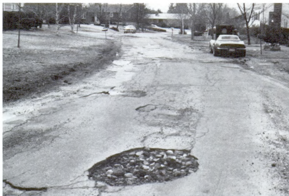
1. Pothole caused by fatigue failure.

while excess water is present, it will eventually pothole. Thinner pavements (under 3 in.) are more prone to this type of potholing because the pavement disintegrates into very small, 1- to 2-in. pieces that traffic can easily dislodge. This type of failure is most common in the spring traffic although it can occur in the summer and fall after heavy rains.