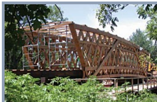
The frame of the Cedar Bridge during reconstruction in the summer of 2004.