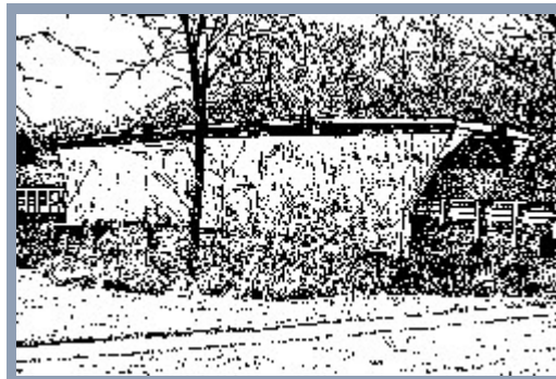
Cedar Bridge, Madison County.

Find information about all the covered bridges of Madison County online, www.madisoncounty.com/bridge.html .