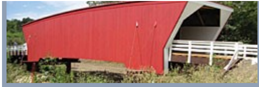
Exterior and interior views of the completely rebuilt Cedar Bridge as seen in late August 2004.