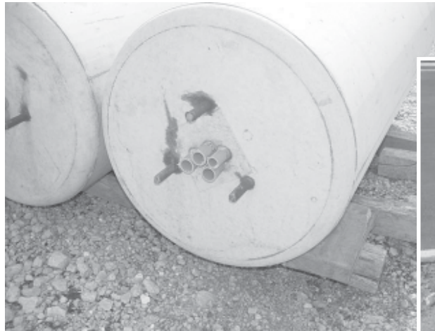
Precast bases come ready with a bolt cage and grounding conduits for fast and easy installation.