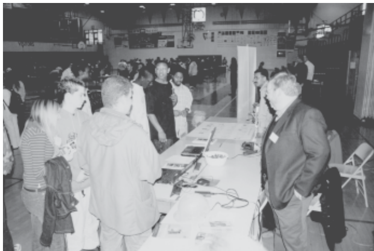
During the 2003 pilot career fair, CTRE and DMACC staff visited two area schools. This demo was at North High School in Des Moines.

Recruiting high school students into professional and technical careers in transportation can be challenging.