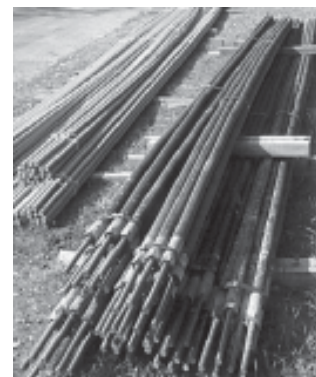
Soil nails can help stabilize retaining walls.

For more information, check out the reference manuals on the FHWA website at www.fhwa.dot.gov/bridge/geopub.htm . Under "Reinforced Soil Structures," look for Geotechnical Engineering Circular No. 7—Soil Nail Walls and Soil Nailing Field Inspectors Manual—Soil Nail Walls . Or contact Curtis Monk, 515-233-7320, curtis.monk@fhwa.dot.gov .