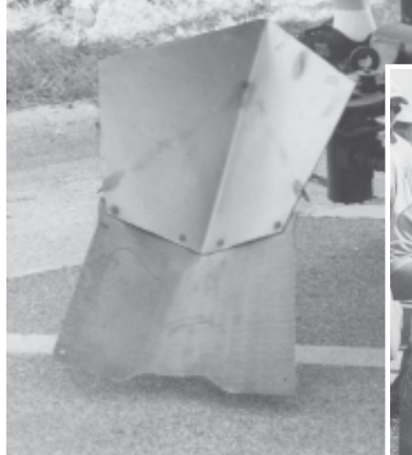
The stainless steel and rubber reciprocating chute spreads salt more evenly on the road.

For more information about installing a reciprocating chute, contact Lyle Haburn, 712-336-2112. •