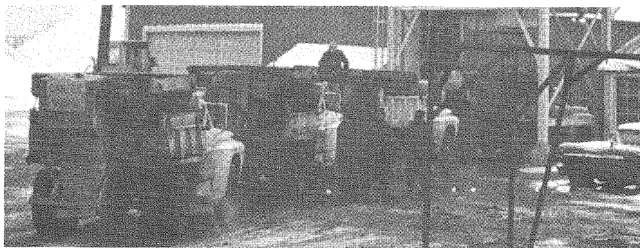
Preseason maintenance ensures equipment readiness.

performed in a timely manner rather than as a response to an emergency situation. Equipment still breaks down, but the bulk of the fleet is ready.