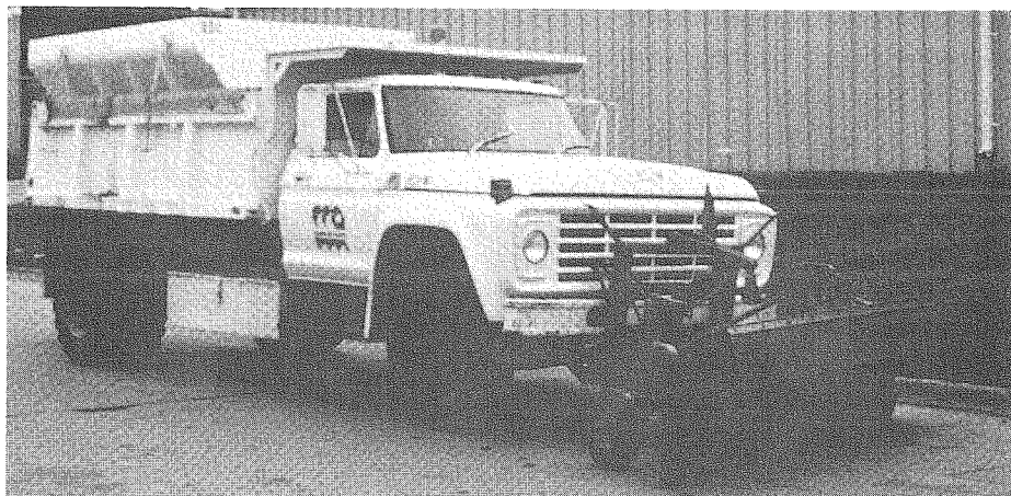
A conventional dump truck is modified for year-round use.

On about October 30 of each year, the city performs a trial snow removal operation with all of its winter snow removal equipment. Also, the operators inspect the equipment to ensure that it is ready for the first snow. This inspection includes tire wear, brakes, clutch, lights on trucks, hydraulic leaks, windshield wipers, conveyors and spinners, plow lights, wheels, cables, and fittings. Although this inspection takes approximately two hours of employee production time, the results at the time of the first snow removal more than offset the cost. Following the inspection, all defects are referred to the central maintenance center so that repairs can be