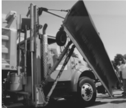
The heavy-duty wing wheel installs easily on the end of the plow blade.

For more information about adding a wing wheel to your plow, contact Herb Morley, 563-245-2724, herbert.morley@dot.state.ia.us .