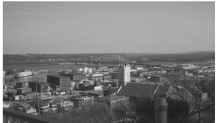
The trail passes through historic Iowa cities like Dubuque.

The planned trail hugs the Mississippi River.