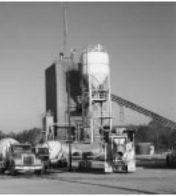
Quality control at the plant is critical to using admixtures and blended cements successfully in concrete mixtures for pavements.