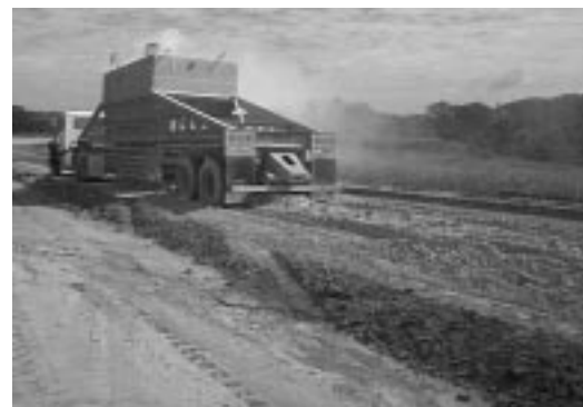
In Iowa, fly ash can be a cost-effective additive for stabilizing soils.