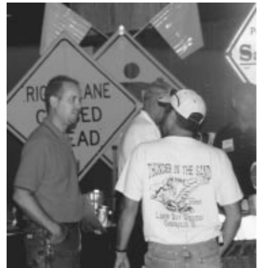
Conference attendees saw signing vendors' latest and greatest products.

For more information, contact Tom McDonald, 515-294-6384, tmcdonal@iastate.edu.