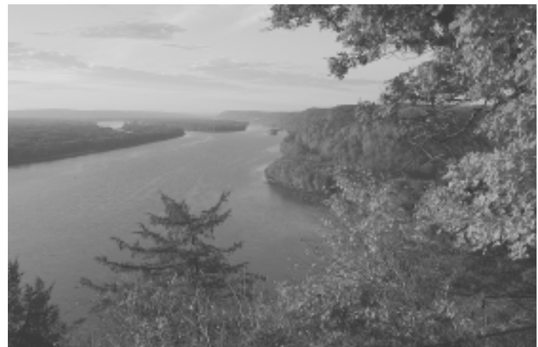
Cyclists will see scenic views of the Mississippi River along the trail.