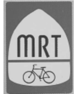
Signs like this are posted along the Mississippi River Trail.

This study was requested by the Iowa Legislature and funded by the Iowa DOT. •