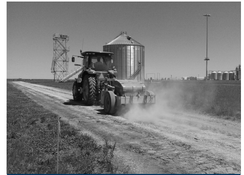
High energy impact roller compaction

In this study, a non-circular-shaped, tow-behind solid steel impact roller weighing about 19,000 pounds was used to rubblize and push down the existing chip seal coat and the granular subbase on a test section. The roller was pulled using a tractor at a nominal