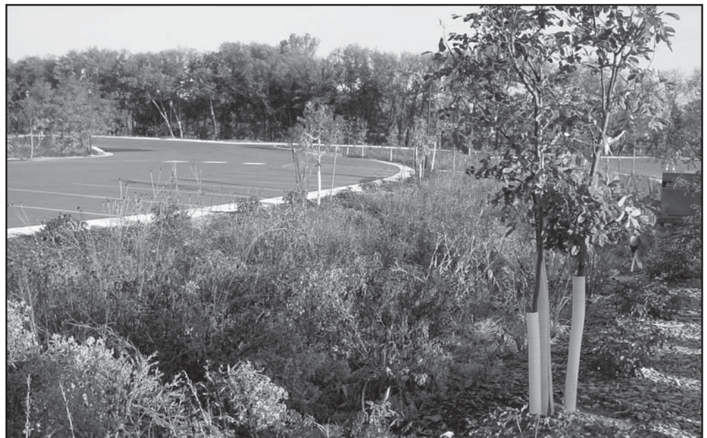
A bioswale captures stormwater runoff and filters it through the soil system.

Reducing water pollution continued on page 2