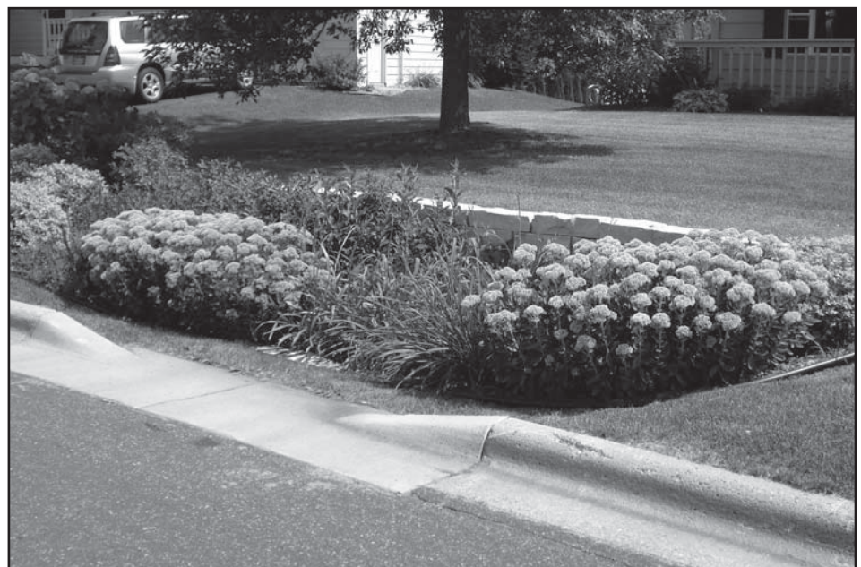
A rain garden is a flexible and aesthetic solution where a landscaped area collects surface runoff and then filters it through a variety of plants and a specially engineered soil mixture.

For more information on implementing stormwater BMPs in your community, consult the Iowa Stormwater Management Manual, available through CTRE at www.ctre.iastate.edu/pubs/stormwater/ ■