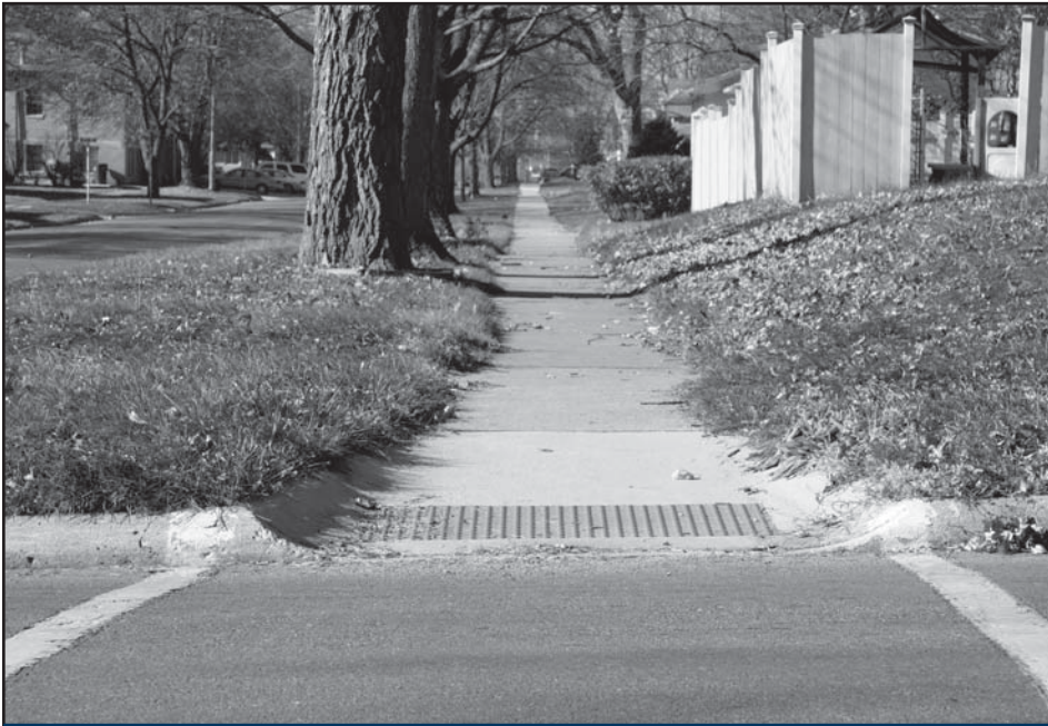
Complete street sidewalks should be four (and preferably five) feet wide, and should have curb ramps at crossings to be accessible to wheelchairs and strollers.

be four feet wide when in an open space and five feet wide when next to a curb or parking.