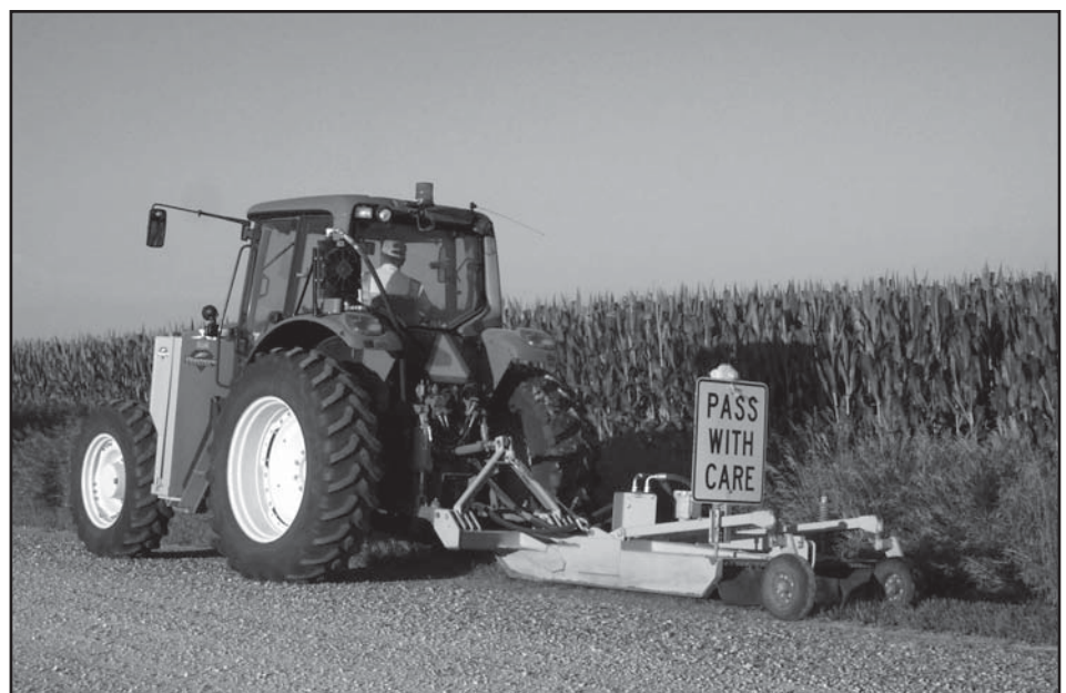
Operator safety is an important aspect of vegetation management for local agencies.

Support vehicles play an important role in improving work-zone safety for mower operators by alerting the public to vegetation management activities, cleaning up debris, and pruning and weed whacking areas difficult and unsafe for mower operators to reach. ■