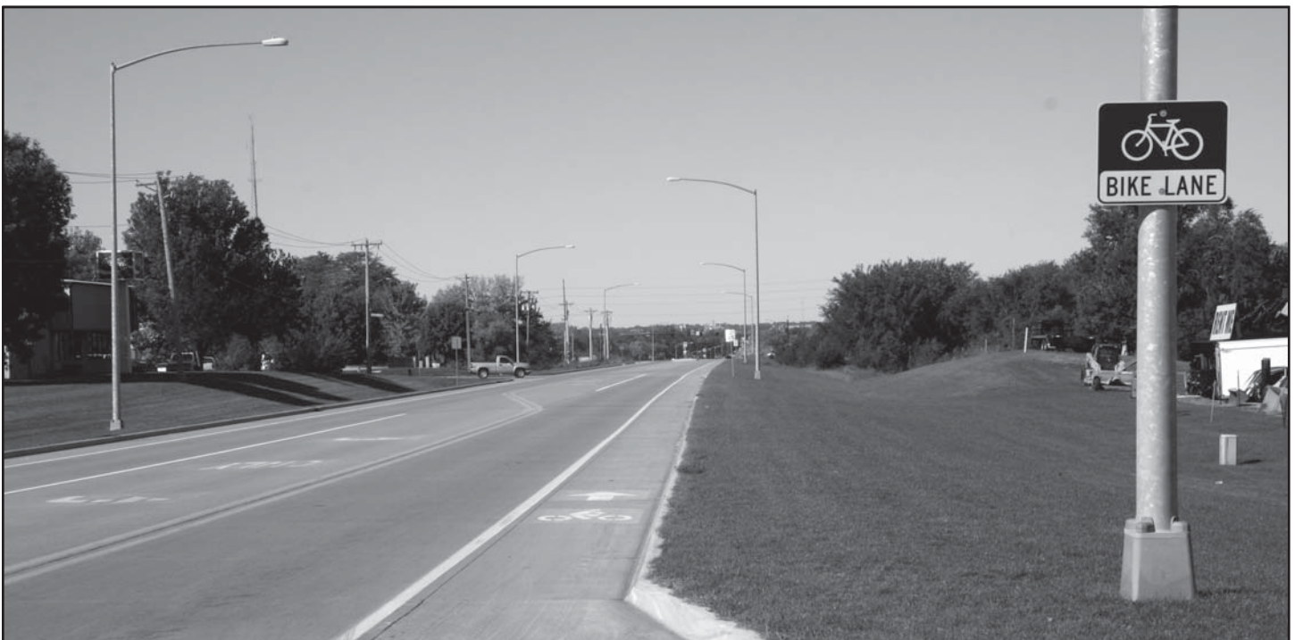
Well-marked bicycle lanes improve travel safety for bicyclists on this high-speed arterial roadway in Ames.

Re-striping the road to create bike lanes is an inexpensive complete streets solution. AASHTO recommends that bicycle lanes