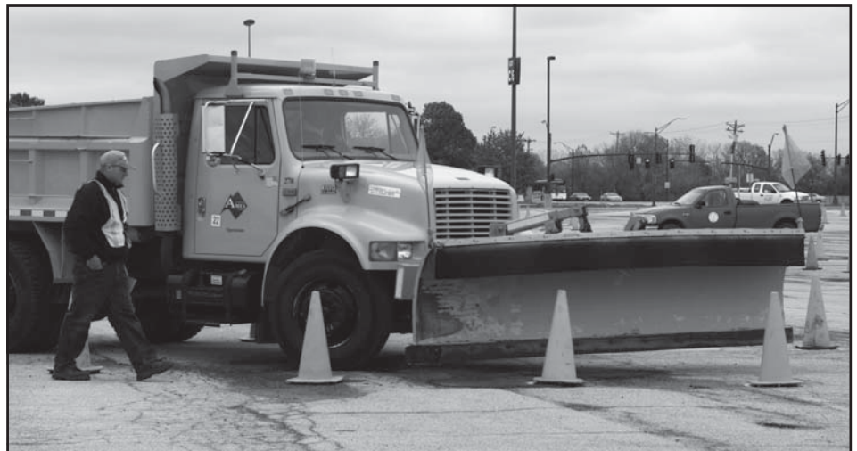
Participants in the Snow Plow Roadeo compete in a five-event driving course.

Visit the Roads Scholars Program at www.ctre.iastate.edu/roadscholar/ . For more information about the online Supervisory Techniques and Skills course, visit www.ede.iastate.edu/Non-Credit/Management/Supervisory-Techniques-and-Skills.html . ■