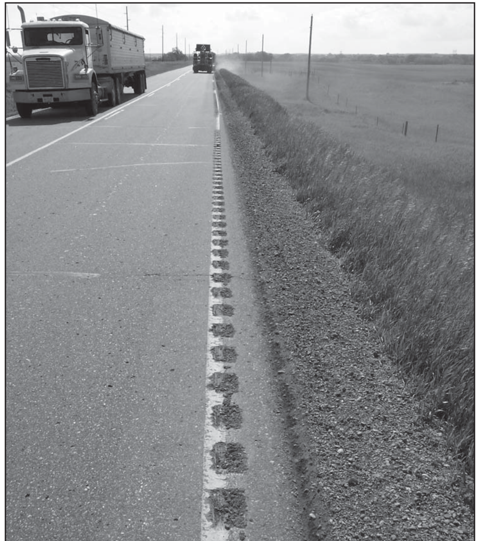
Milled-in rumble strips are applied to a county road, which will soon be painted over with edge line striping resulting in a "rumble stripe" (photo courtesy of Bob Sperry, Iowa LTAP).