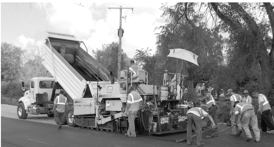
Handwork at Prairie Lake Park Urban Fishery in Cedar Rapids, Iowa.