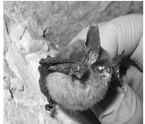
Northern long-eared bat with white-nose syndrome.

Iowa State University, InTrans, and the Bridge Engineering Center are partnering with the Iowa DOT, the U.S. Fish and Wildlife Service, and the FHWA to conduct a critical study entitled, “Assessing Bridge Characteristics for Use and Importance as Roosting Habitat for Bats.”