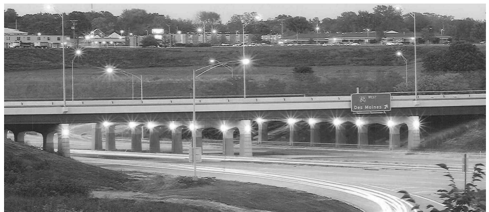
Interstate 80 in Iowa.

For information on Iowa DOT specifications regarding PWL, contact Scott Schram, 515-239-1604, Scott.Schram@dot.iowa.gov . ■