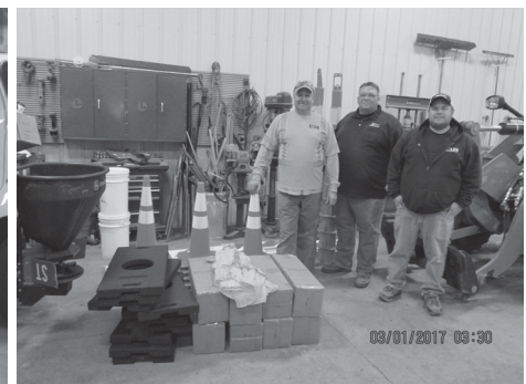
From left to right: A look inside the package and winners from Solon, Iowa.