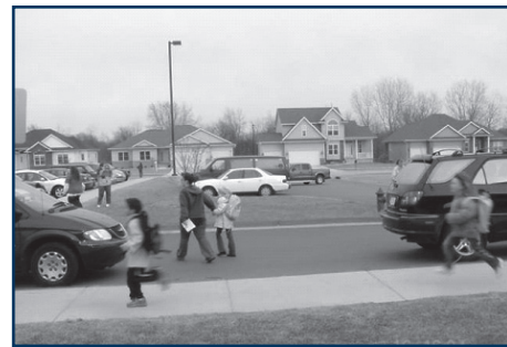
Source: Toolbox to Address Safety and Operations on School Grounds and Public Streets Adjacent to Elementary and Middle Schools in Iowa.