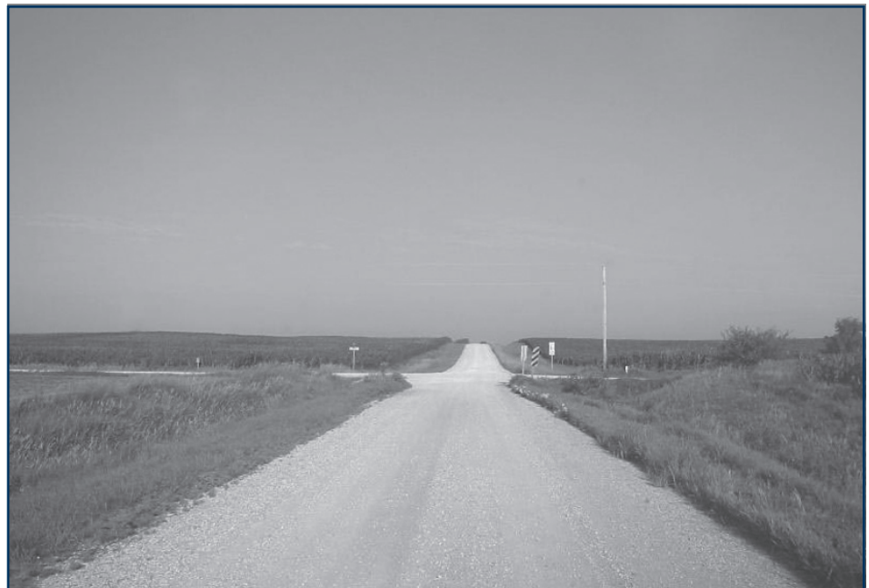
Ultra-low-volume unpaved rural intersections like this one may not need stop signs