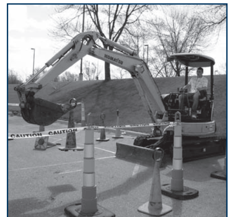
One of this year's most popular activity stations was the mini excavator, where students could experience firsthand what it's like to work with construction equipment.