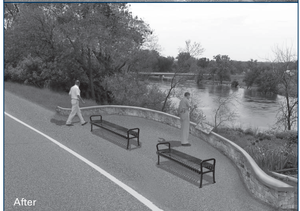
Gilbertville participated in the Living Roadways Community Visioning Program in 2005. The images depict the existing view of Cedar Creek and the same view with proposed enhancements in place.