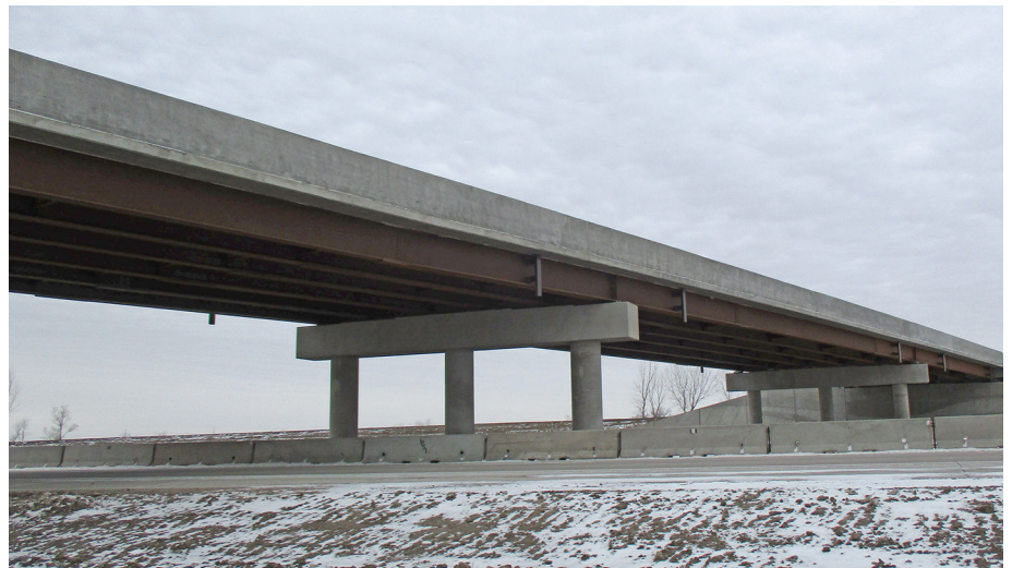
Salix Interchange Bridge on County Road K25 over I-29 in Woodbury County, Iowa

In addition, while several researchers have recently focused on investigating the general accelerated uniform corrosion and galvanic corrosion properties of A1010 steel, additional tests of galvanic corrosion may be essential for A1010 steel in contact with dissimilar metals at in situ bridge sites.