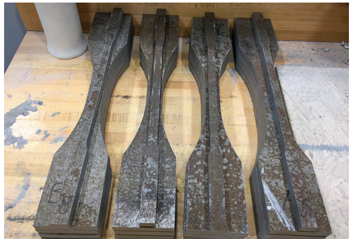
Coupon sample specimens for fatigue testing