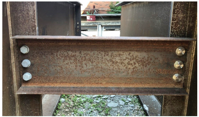
Girder cross frame specimen for galvanized corrosion monitoring with galvanized steel bolts on the left and stainless steel bolts on the right

To characterize the behavior of galvanic corrosion of the A1010 steel in contact with other metal, this study implemented galvanic corrosion evaluation testing on a full-scale girder cross frame and also on an exposed A1010 steel plate at the bridge site.