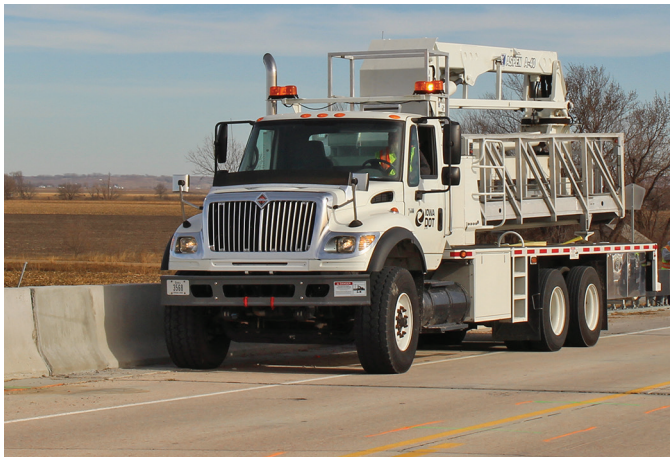
Live-load testing on the bridge

Both of these test specimens were constructed using different types of steel bolts and welds for comparison purposes, and corrosion testing on them will be ongoing.