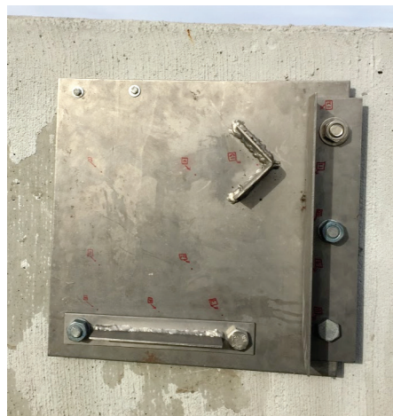
A1010 steel plate with stainless steel and galvanized steel bolts and welded connection