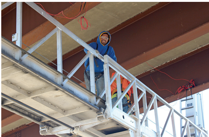
Instrumenting the girders for the live load tests