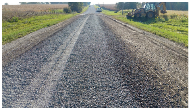
Local BFL Class A materials placed on the third test section