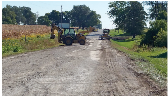
LCF Class A test section before construction on CR J22 in Decatur County, Iowa

The length of each test section was 500 ft except for one section (OFD Class A), which was 300 ft long, and each was 30 ft wide and 4 in. thick.