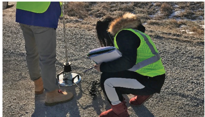
Lightweight deflectometer testing on a section