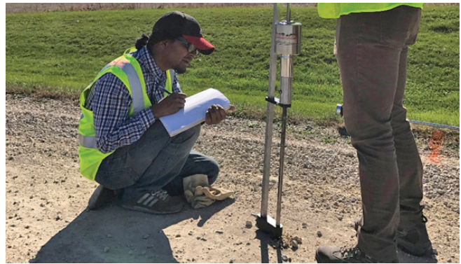
Dynamic cone penetrometer testing on a section