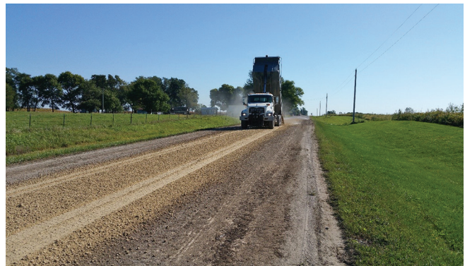
OFD Class A test section during construction on CR J22 in Decatur County, Iowa