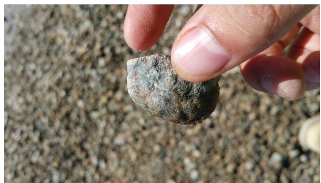
Close-up of CRG Clean materials, noting its round shape