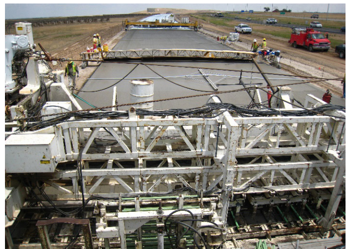
Figure 3. Paving of U.S. Highway 287 using PLC.

Ralph Bell, CEO of Castle Rock Construction commented that they have partnered with cement manufactures on more than thirty projects over the past decade, and Portland limestone cement has been an integral part of their intense effort to improve the quality and rideability of more than 600 lane miles of concrete pavement in Colorado.