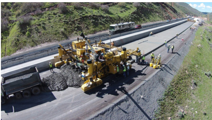
Figure 7. Paving eastbound I-80 lanes.

The use of PLC in paving projects with UDOT has proven