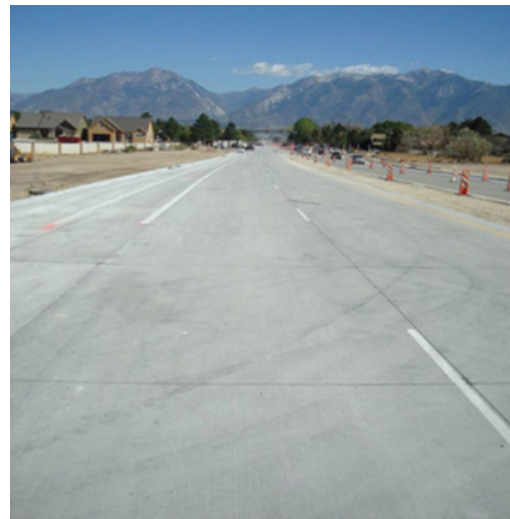
Figure 6. SR 201 after paving.

Two months later in October, the westbound lanes were constructed with PLC containing 10% interground limestone and 25% Class F fly ash. This provided UDOT and the contractor with an opportunity to compare concrete paving with both OPC and limestone cement. The westbound lanes