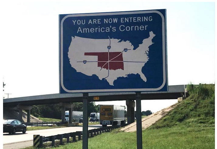
Figure 8. “America’s Corner” sign in Oklahoma.

Commuters and truck drivers expected a durable, safe means of travel that would outperform their previous crumbling roadway. A Type 1L (10) cement with 10% limestone was used. ODOT was confident in using this cement over OPC and awarded the mainline paving aspect of the project to Duit Construction, which bid the project with the use of Type 1L cement. John Privat, Quality Manager of Duit