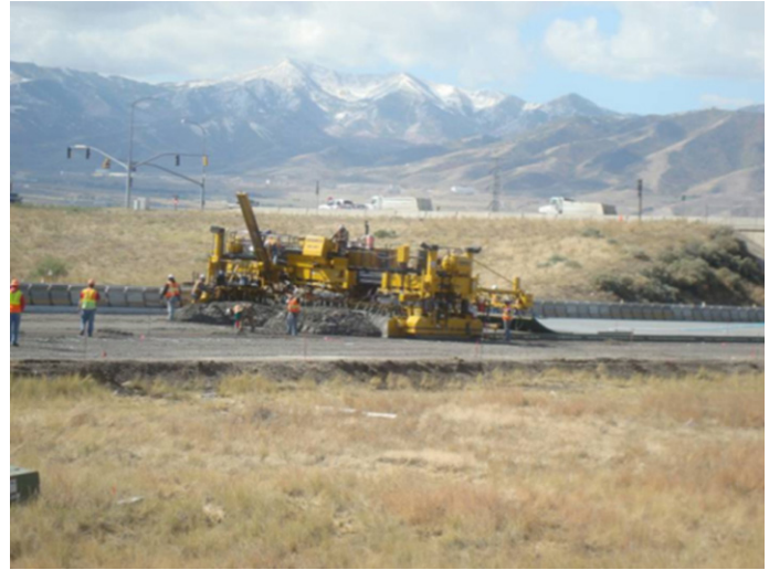
Figure 5. SR 201 during paving.