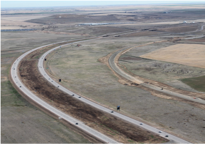
Figure 4. Paving of U.S. Highway 287 using PLC.