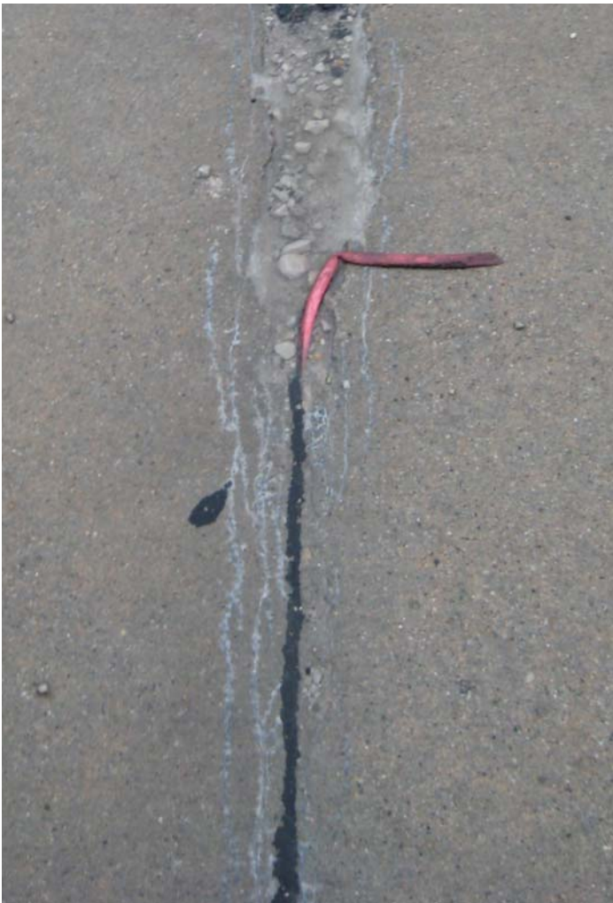
Figure 3. Evidence of concrete saturation