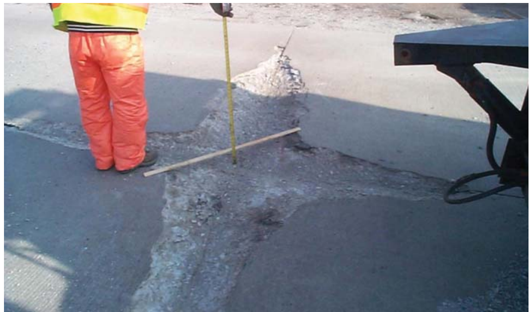
Figure 2. Loss of material