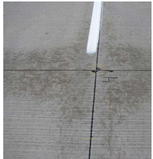
Figure 1. Typical shadowing

in pavements ranging in age from 5 to 15 years old. The distress is often initially observed as shadowing (Figure 1), because microcracking near the joints traps water; later, the joint exhibits significant loss of material (Figure 2).