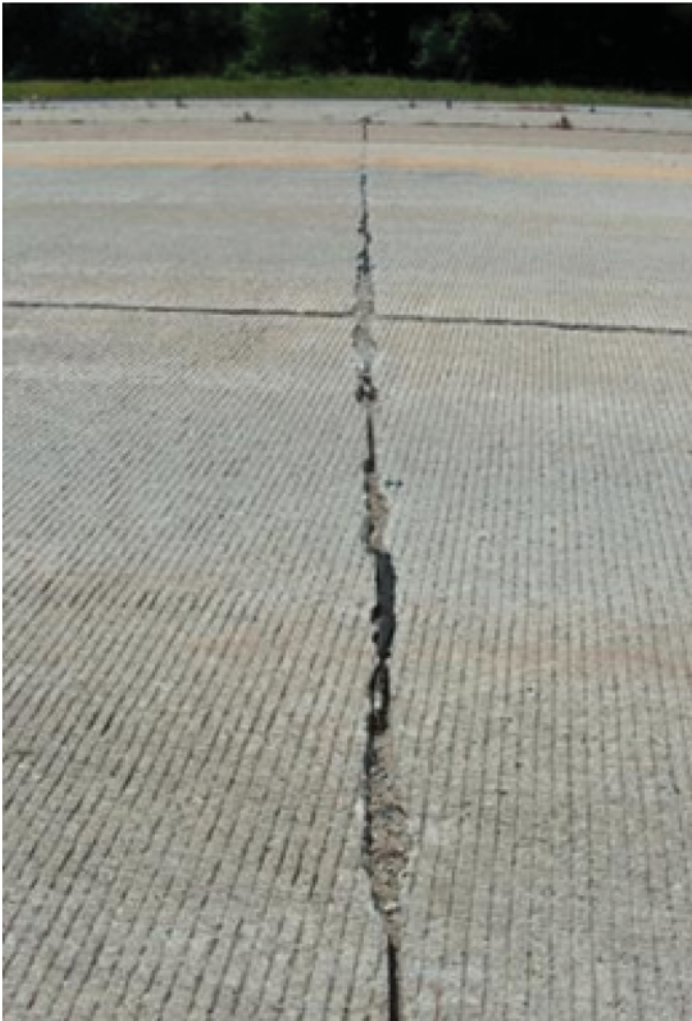
Figure 4. Typical mechanical distress