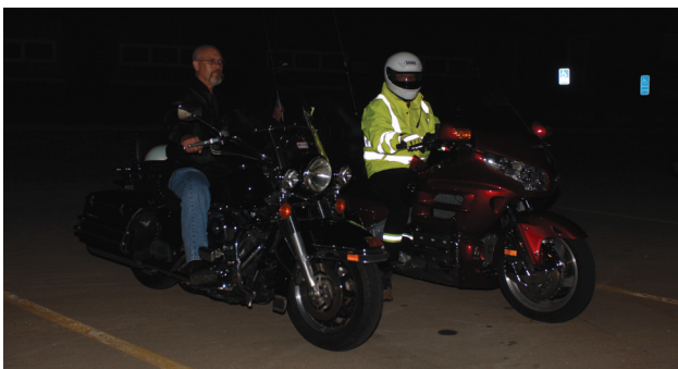
Helmet color and reflectivity at night (Iowa DOT)