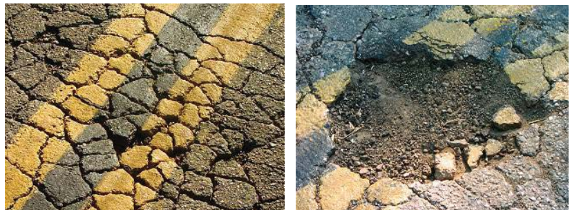
Pavement failure examples (alligator cracks, left; pothole formation, right)

The co-products were mixed with asphalt binders at varying levels, from 3% to 12% by weight, resulting in 52 treatment combinations that underwent asphalt binder performance testing. Each treatment combination was performance tested after being blended in a high-speed shear mill. The performance testing consisted of dynamic shear rheometer and a bending beam rheometer testing coinciding with field simulative aging using a rolling thin film oven test and pressure aging vessel. Testing was performed to appropriate specifications.