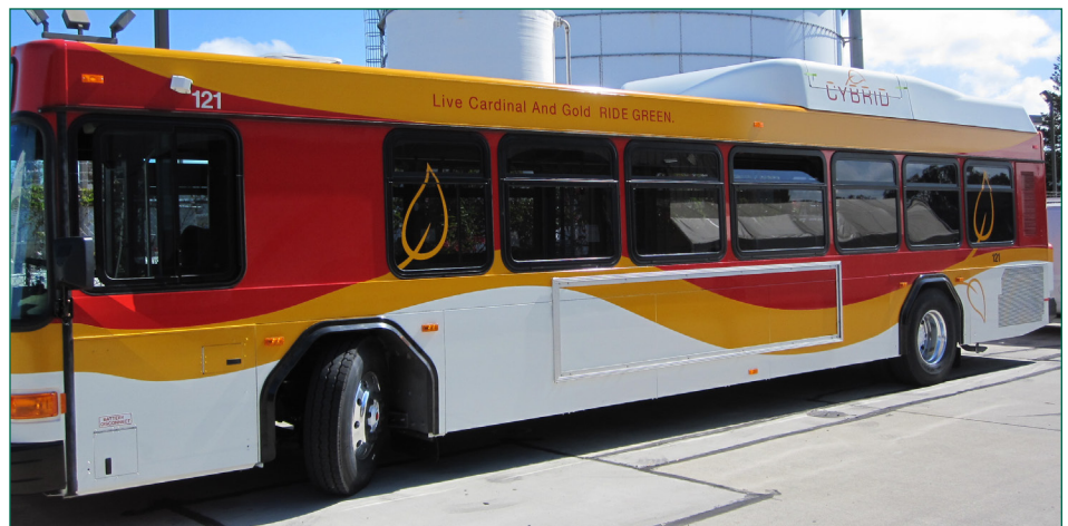
One of 12 hybrid CyRide buses

This technical brief summarizes information about the costs and benefits that have been attributed to use of hybrid transit buses as found in the literature. Results from a demonstration project that compared fuel economy and emissions for 12 hybrid buses and 7 control buses for the transit agency for Ames, Iowa and Iowa State University, CyRide, were also included.