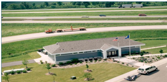
MnRoad National Research and Technology Center

Noise measurements have been conducted on the overlay at MnROAD and reveal a remarkably quiet pavement. (While