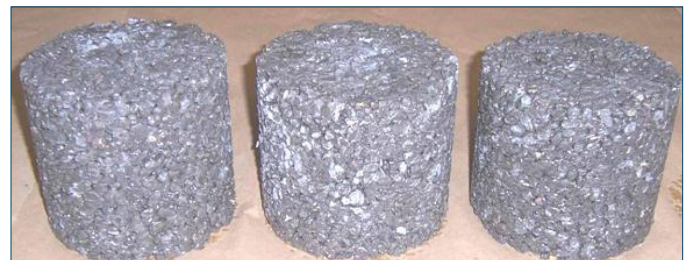
New gyratory compaction test method characterizes pervious concrete workability

To ensure good performance during both the construction and service periods, a PCPC mixture for a pavement overlay must possess the following properties: