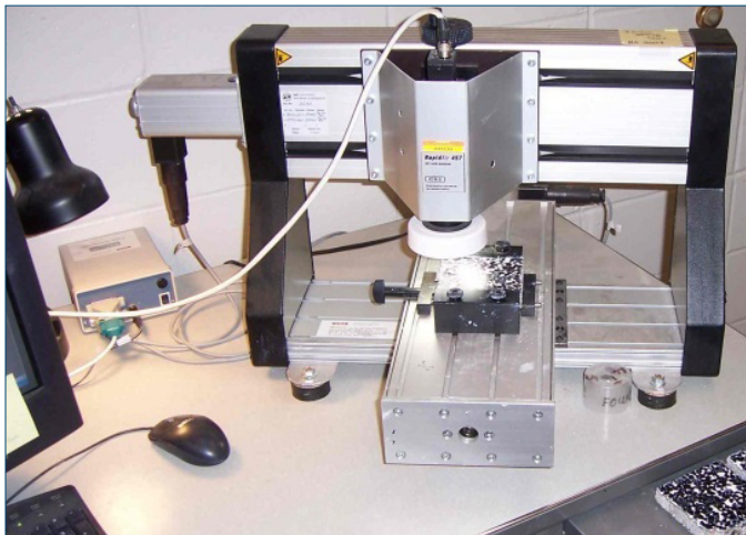
RapidAir tests determine entrained air void structure

The research results were designed to be widely accessible and easily applied by designers, producers, contractors, and owners. (Each chapter of the report is written as a standalone document that may be read and understood on its own.)