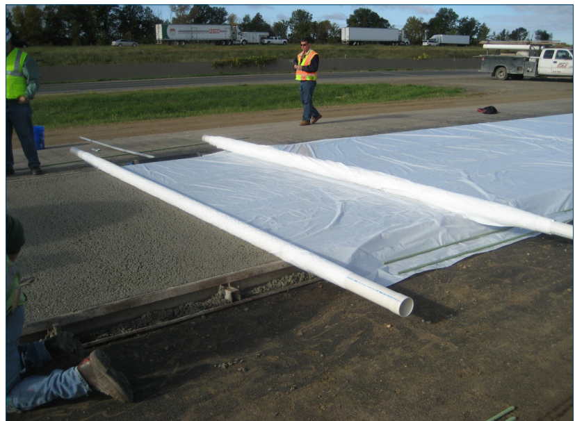
Completed surface of pervious overlay covered with two layers of plastic

This project represents the largest and most comprehensive study to date on portland cement pervious concrete (PCPC). The integrated research objectives included finding optimal pervious concrete mix designs for wearing course sections in pavement applications. Information for the wearing course sections needed to address the issues of noise and skid resistance, assuming adequate strength and durability were developed.