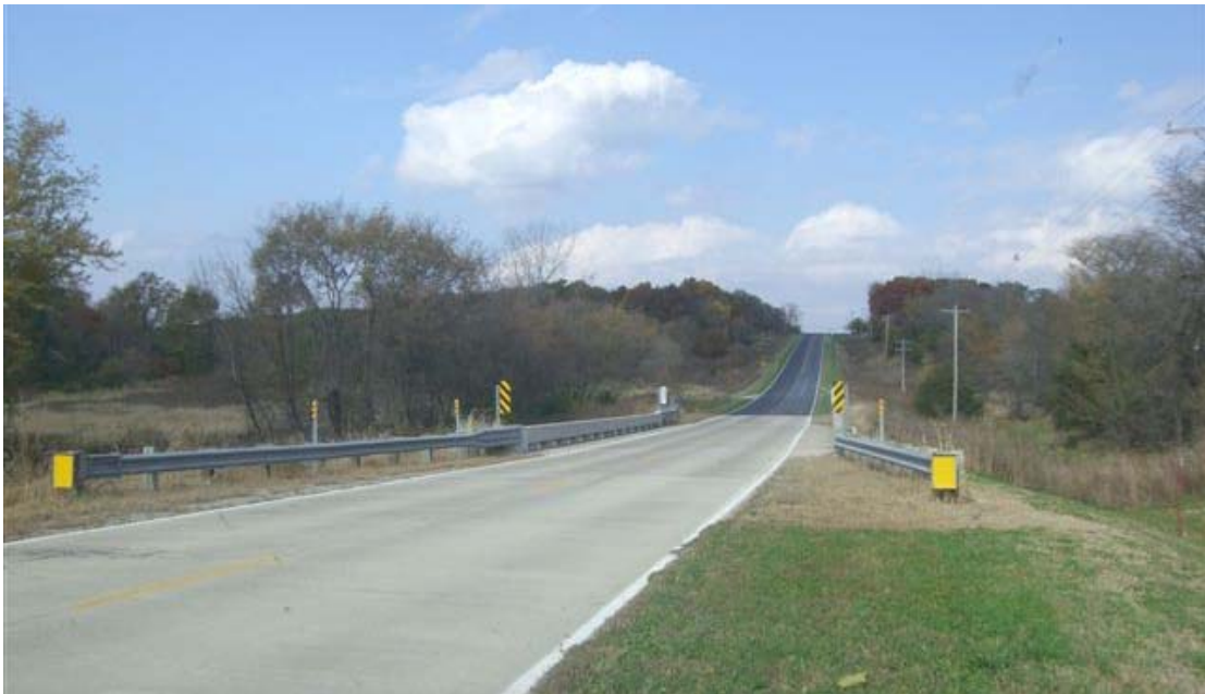
Figure A.6. Guardrail and delineation at newer bridge