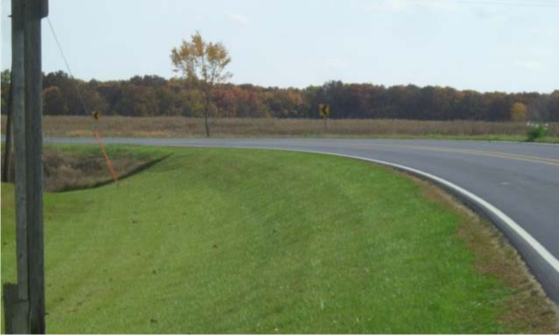
Figure A.5. Chevron installation along horizontal curve