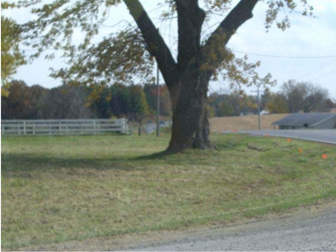
Figure A.3. Large tree obstructing view from side road at Sage Avenue intersection