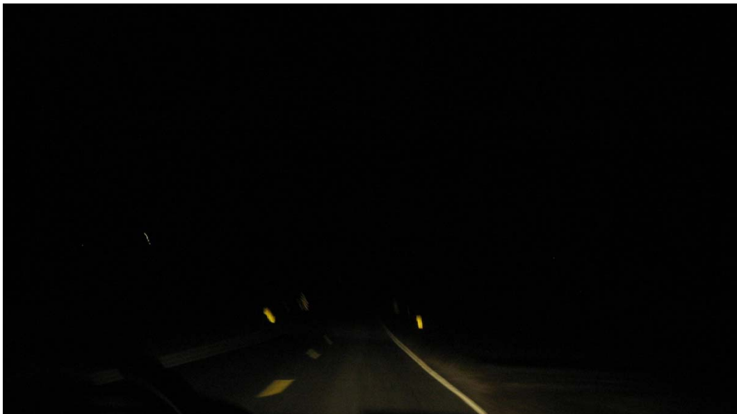
Figure A.8. Nighttime view of pavement markings and guardrail delineation at bridge