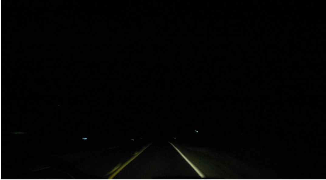
Figure A.7. Nighttime view of pavement markings