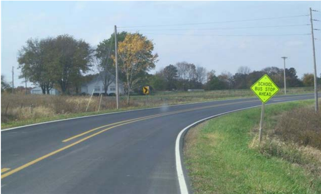
Figure A.1. School bus warning sign and chevron along horizontal curve at Palm Boulevard intersection