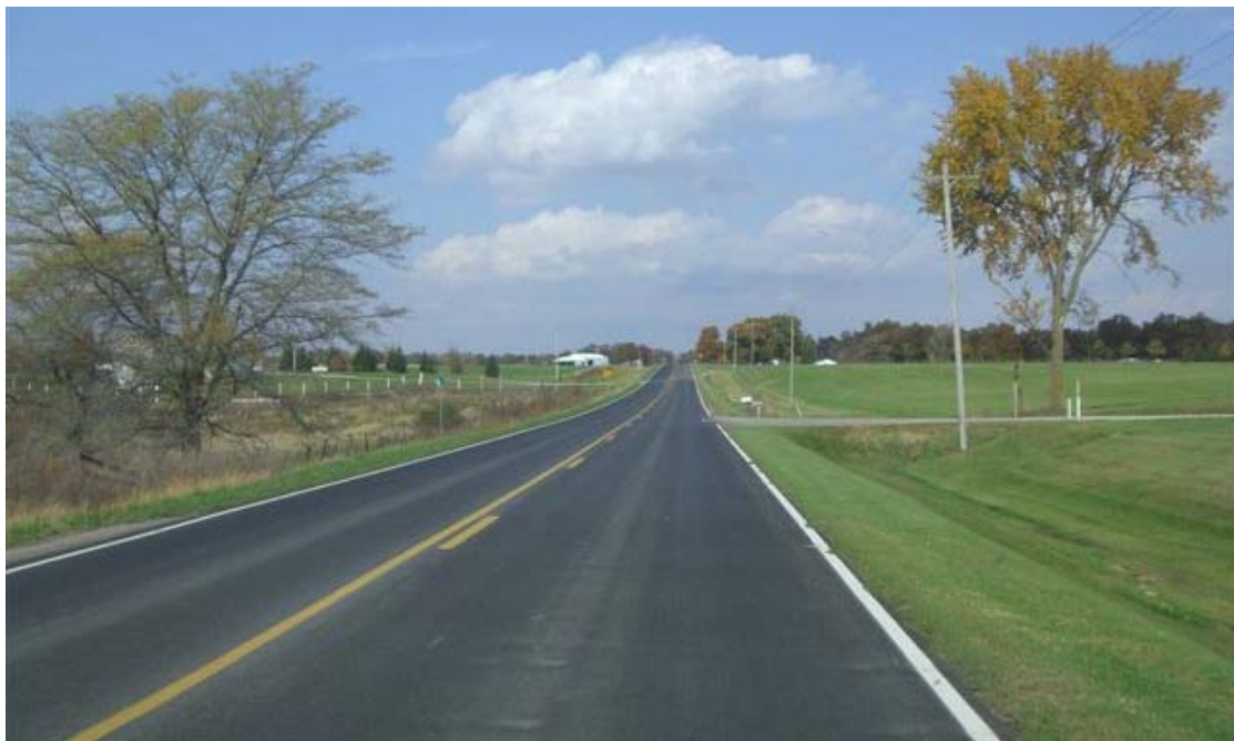
Figure A.2. Pavement markings on County Road H-46