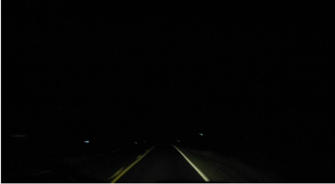
Figure A.7. Nighttime view of pavement markings