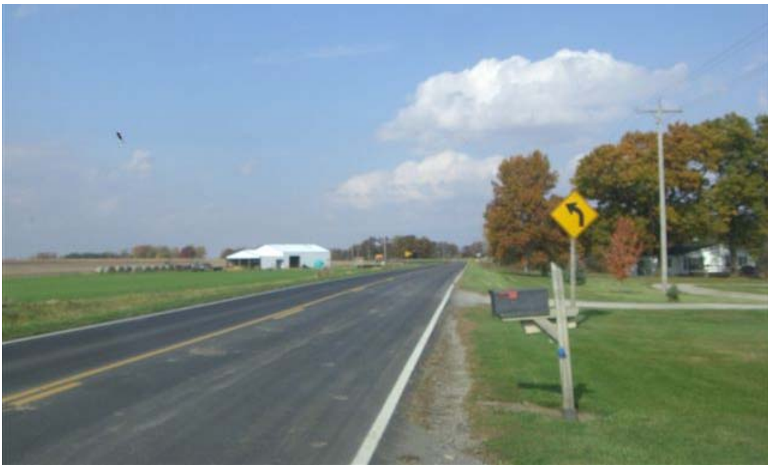
Figure A.4. Curve sign and mail box