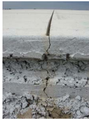
Test section joints showing different sawing depths: conventional sawing to one-third pavement thickness (left), conventional sawing to one-quarter pavement thickness (middle), early entry sawing (right)