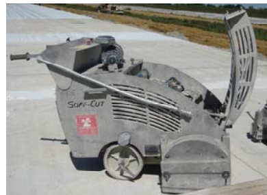
Conventional sawing equipment Early entry sawing equipment