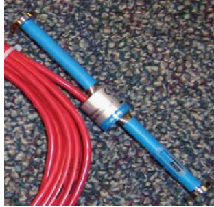
Geokon 4200 vibrating wire strain gage used in this study

In this study, ten joints were made with the early entry sawing method to a depth of 1.5 in., and two strain gages were installed in each of the joints. Another ten joints were made with the conventional sawing method, five of which were sawed to a depth of one-third of the pavement thickness (3.3 in.), and the other five of which were sawed to a depth of one-quarter of the pavement thickness (2.5 in.). One strain gage was installed in each of the joints made with the conventional sawing method. In total, 30 strain gages were installed in 20 joints.