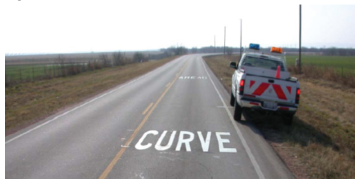
Figure 3. On-pavement curve markings (Chrysler and Schrock 2005)

The researchers collected before and after data on both a test site and a control site. The researchers used 8-ft white letters spelling SLOW at the test site, along with two white lines perpendicular to the flow of traffic and a left curving arrow (see Figure 4).