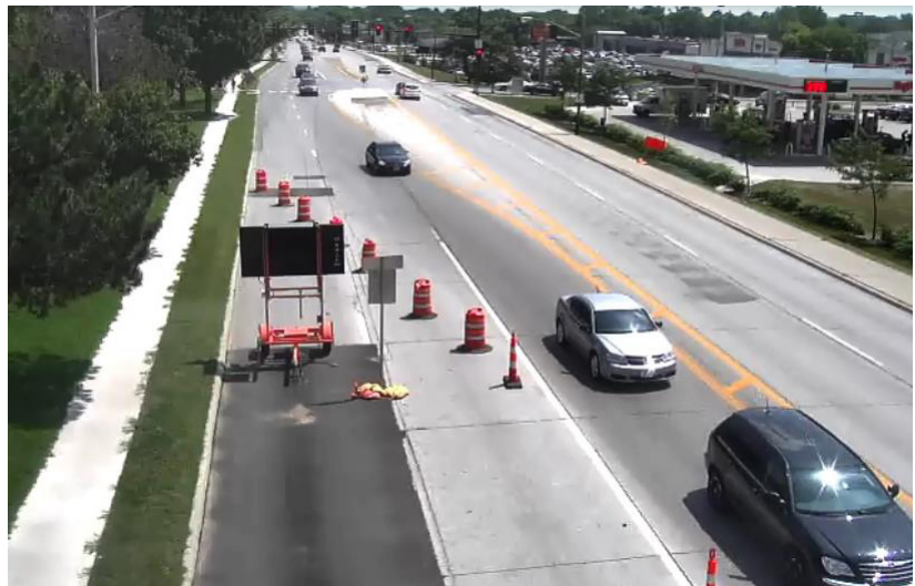
Camera view of urban work-zone merge used as part of this research