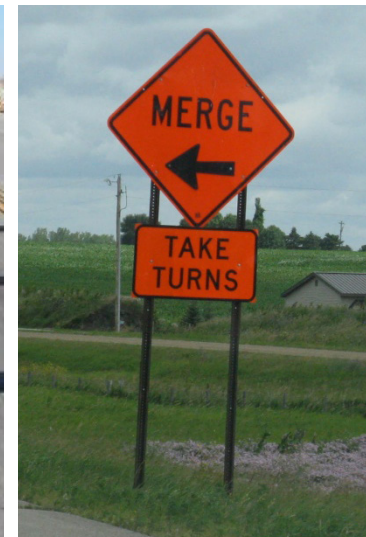
Late merge signs top and bottom right, variable speed limit equipment middle left, dynamic merge equipment middle right, and temporary rumble strips bottom left