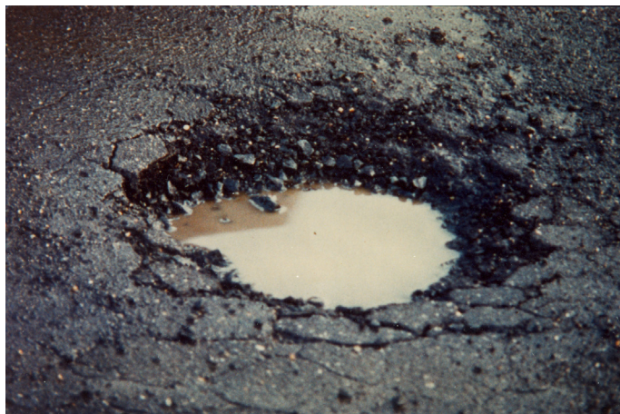
Deteriorated asphalt pavement

Moisture damage is a significant problem for flexible pavements. The damaging effect of moisture on pavements, specifically hot mix asphalt (HMA), is a significant environmental distress that should be considered. As a pavement is subjected to a freeze/thaw cycle, the material expands and contracts. During expansion, water can seep into permeable air voids created with the increased volume and can freeze. When the material contracts during thawing, the water can propagate the cracks created during freezing and cause further damage in the next freeze cycle, ultimately weakening the structural strength of the pavement layer. Over time, the repetition of the freeze/thaw cycle deteriorates the pavement and can lead to mix instability and road damage, such as ruts, if the moisture-susceptible mix is below the surface mix. Surface mixes that are susceptible to moisture damage can experience raveling. Identifying pavements susceptible to moisture damage and the effects of moisture damage on the life of pavement can reduce maintenance costs accrued with the placement of a poorly performing HMA.